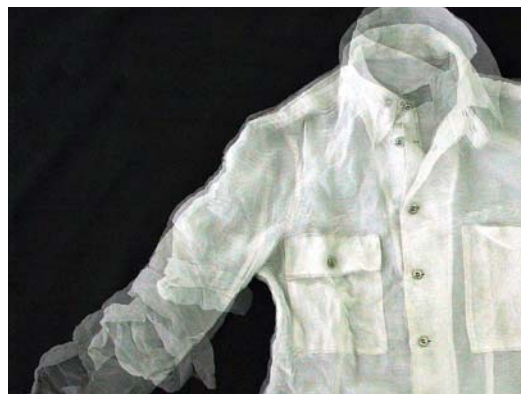
Functional clothing – Grado Zero Espace has used Shape memory alloys to manufacture a shirt with memory